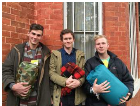
The Northern Folk helping St Matthews Crisis Care—helping the homeless in our community