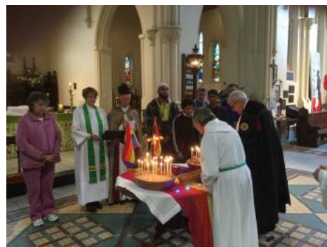
Remembering and lighting candles for Orlando victims