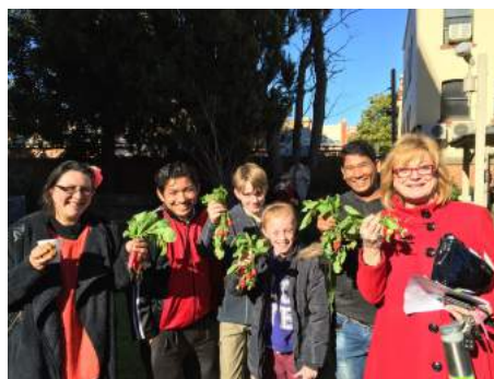
Harvest from the Bhutanese Garden