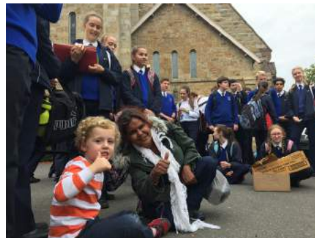
Victory Lutheran College Students—Soup Kitchen Day