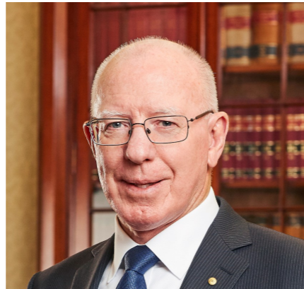
His Excellency General the Honourable David Hurley AC DSC (Retd).

His Excellency General the Honourable David Hurley and Mrs Linda Hurley have been significant friends of the Music Association and Festival. They were present at the launch of the third Festival in 2017 and attended the Festival itself in 2018 as Governor of NSW. More recently they hosted a visit of students sponsored by the Association at Yarralumla. Their interest in the work of the Association, particularly the development of the musical skills of our youth, has been a great encouragement and it is a particular joy that His Excellency has accepted the invitation to be a Patron.