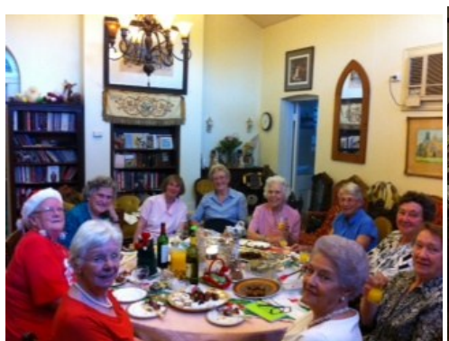
Evening Group A.G.M