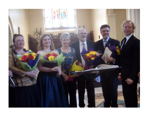
Principal Singers presented after 'The Messiah'