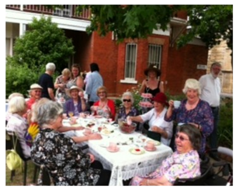
M.U. fundraiser 'HighTea with strawberrries.'