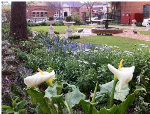
The Rectory Garden in all it's Spring beauty

Bookings to me on 60212869 Helen Martin on 60212869