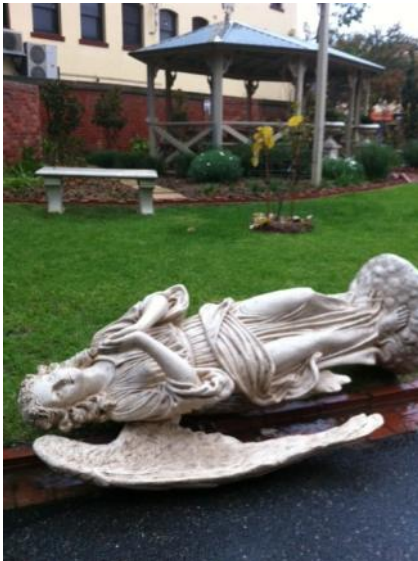
'Fallen Angel foils attack ! - the thieves couldn't get her over the fence!

St Ned's—Communion Service at Murray Gardens