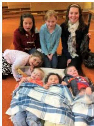
Dederang—This is different—sleeping in church!