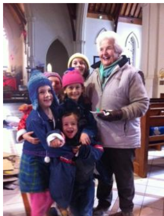
Anticipation for the sleepover!