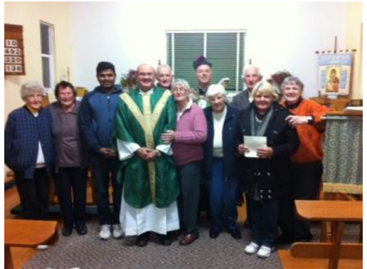
St Matthew's clergy celebrate at Tawonga, sharing ministry across the Deanery

St Ned's—Communion Service at Murray Gardens