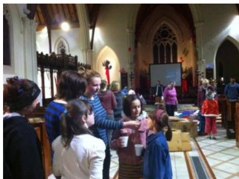
‘ Really, how cold will it be?’