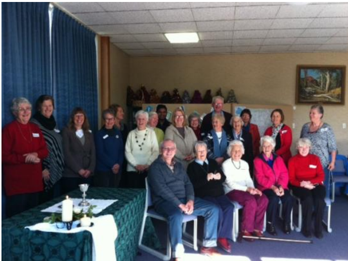
St. Matthew's Pastoral Partners Team

Coordinator, in conjunction with St. Matthew's ministry team.