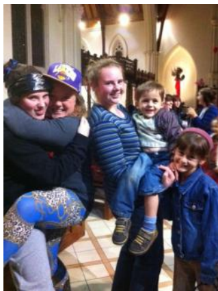
Some of the participants of sleepover.