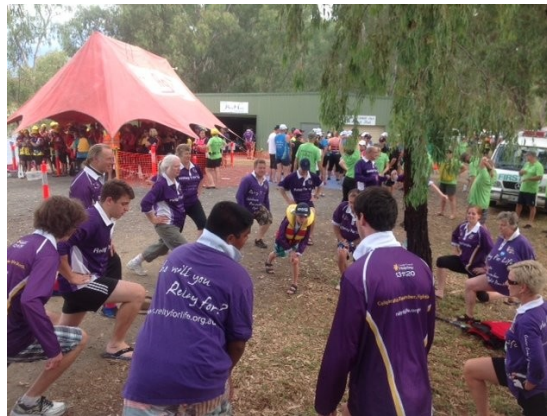
Limbering up for the Dragon Boat Race