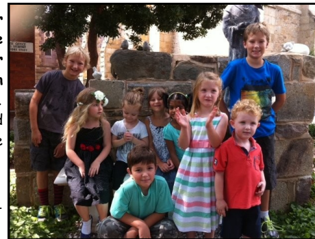
Children's Church children in the garden

Children's Church spokesperson for M.U. Albury