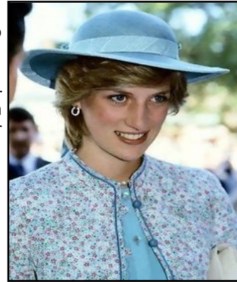
Princess Diana at the service