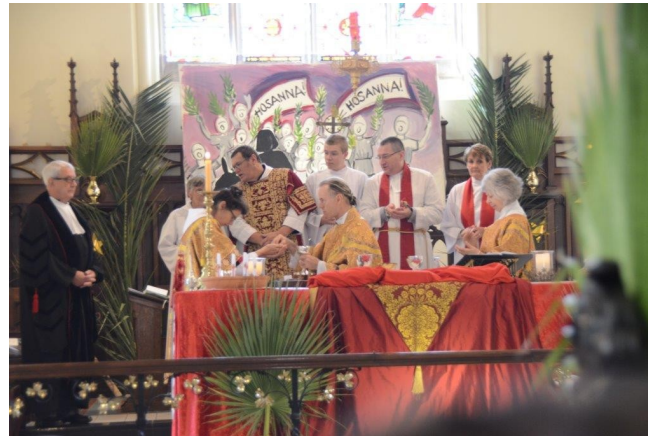
2 aspects of the Palm Sunday service