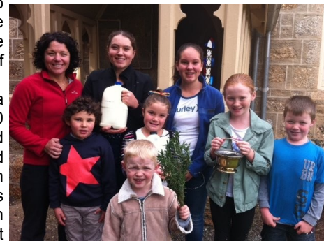
Real milk, real people and real leg power at Yackandandah when the electronic organ failed and the old pedal organ came to the rescue