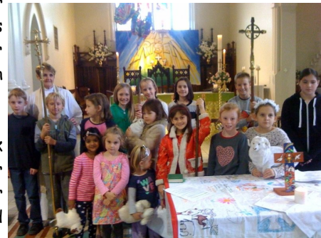
Children's Church children in May!

The children, as usual grouped around the children's altar during the preparation, and one of the older children asked the 3 questions included in the preparation for Communion, with the congregation answering.