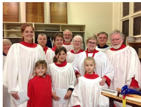
Choir at Synod