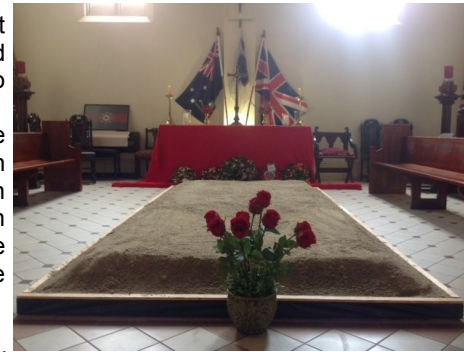
Field of Remembrance in St. Matthews