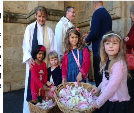
Children with Flowers for Mother's Day