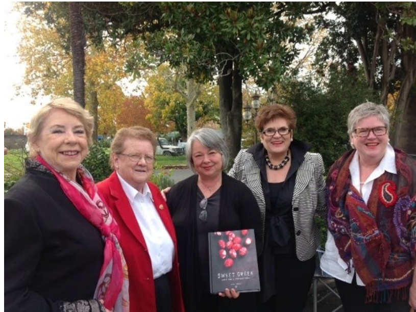
Biggest Morning tea at Adamshurst

Account Name ; St Matthew's Church Albury No 1 Account BSB 082 406 Account no. 17053 2923