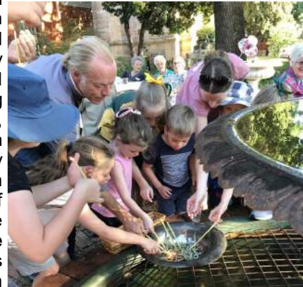
Above: Burning the Palm Crosses at Shrove Tuesday.