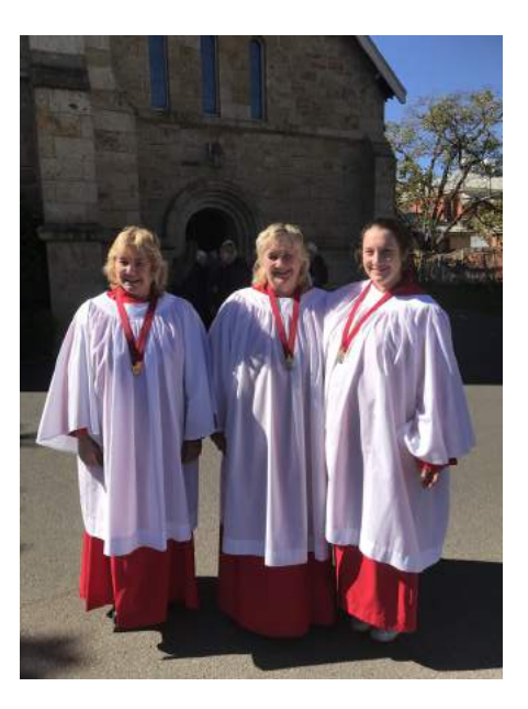
Sunday 9th September