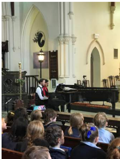
Tunes on Tuesday Concerts 1.10pm to 1.50pm