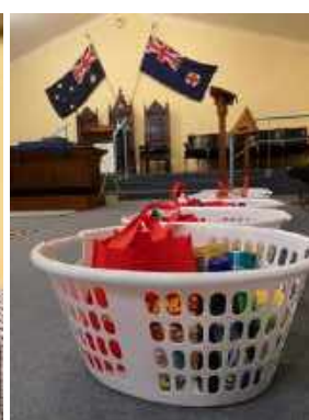
Lodge Christmas collection