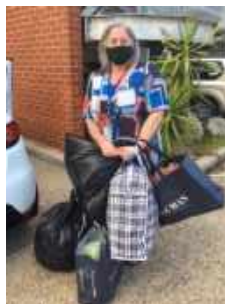
Donation from Hilltop